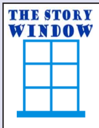
Improvisational writing program Grades PK-2

Our author visit is a two-part, interactive program.