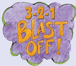
The Texas History Gameshow Grades 3-4

We can create a custom presentation with elements from both programs that will entertain a diverse age group.